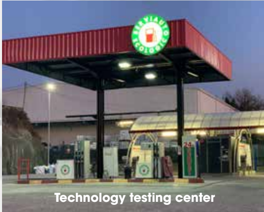
Technology testing center